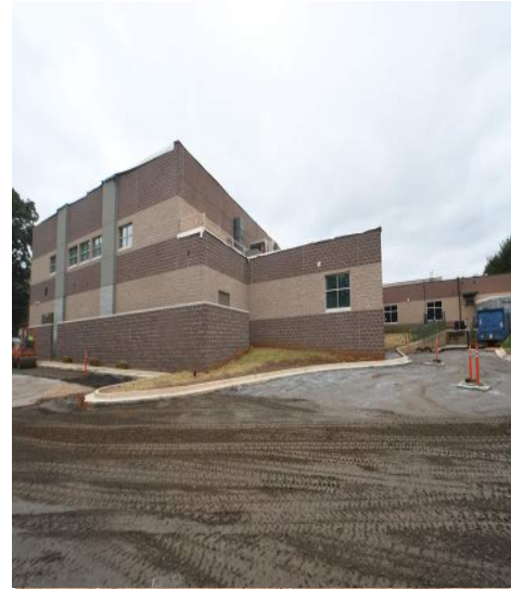
East side exterior view