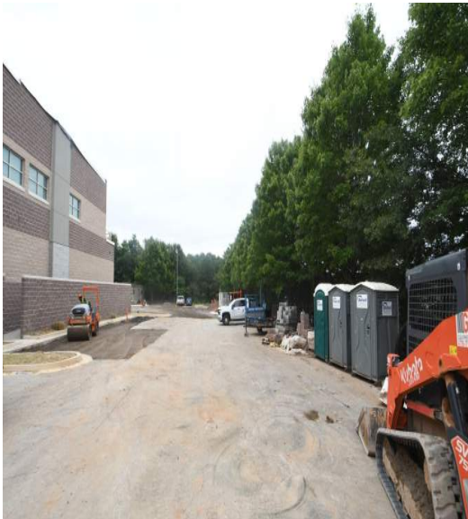
Exterior view - ramp entrance