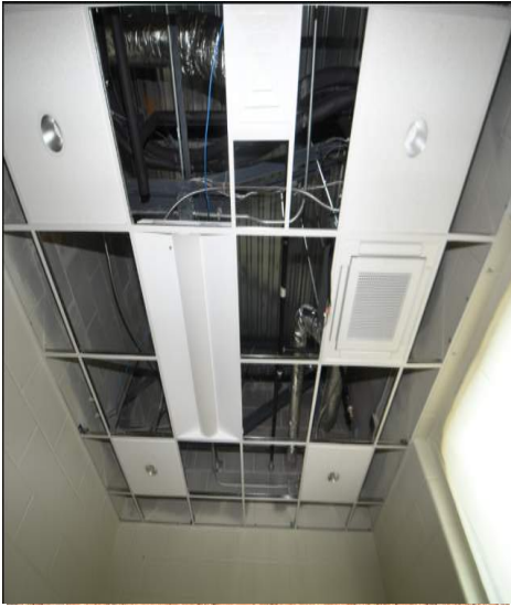
Light installation ongoing