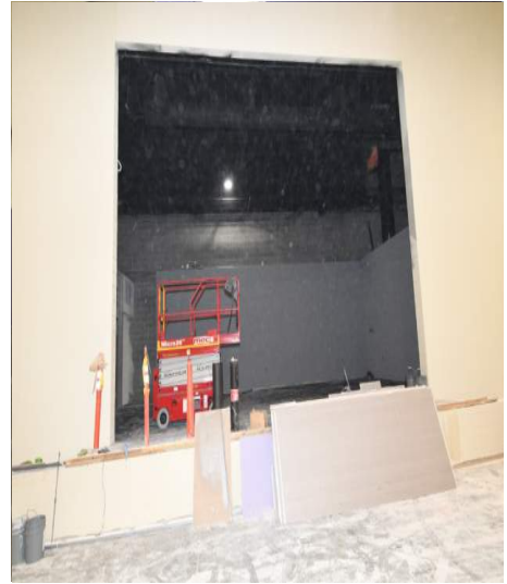
Stage area dryfall started