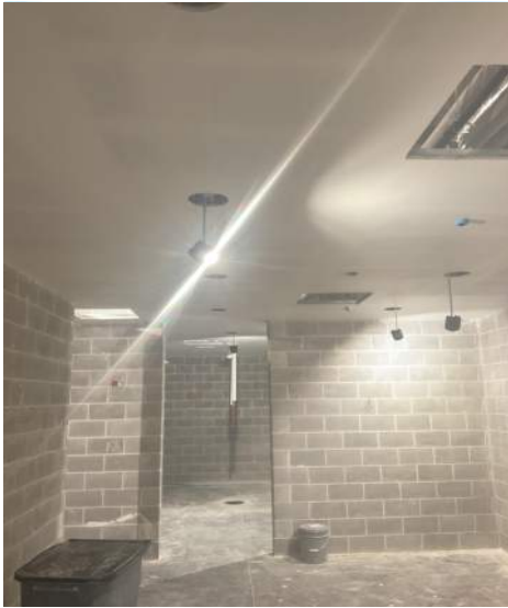
Locker room sheetrock ceiling complete