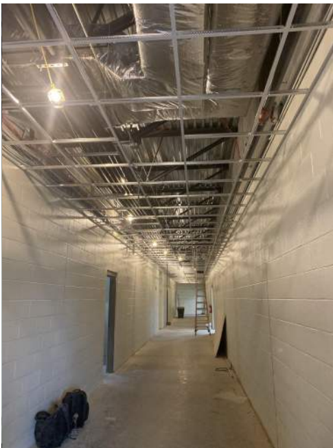
Ceiling grid installation ongoing