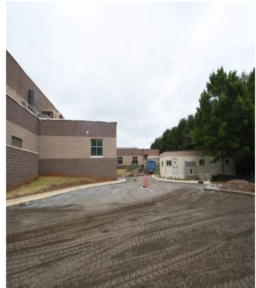
Exterior view – delivery entrance